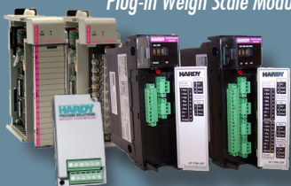
Allen-Bradley® Compatible Plug-in Weigh Scale Modules

Controllers, Weigh Modules, Transmitters